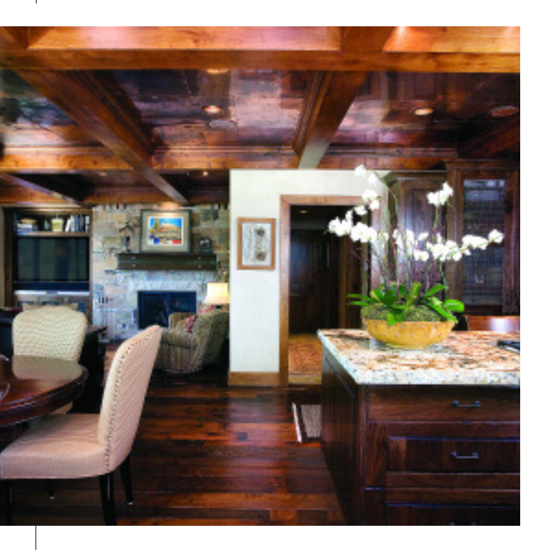
AN OPULENT APPRECIATION OF COLOR AND TEXTURE INFUSES THE HOME WITH RUSTIC ELEGANCE.

LIGHT COUNTERTOPS WITH FLECKS OF RICHER COLOR COMPLEMENT THE DARK, WALNUT CABINETRY AND DISTRESSED COPPER CEILING.