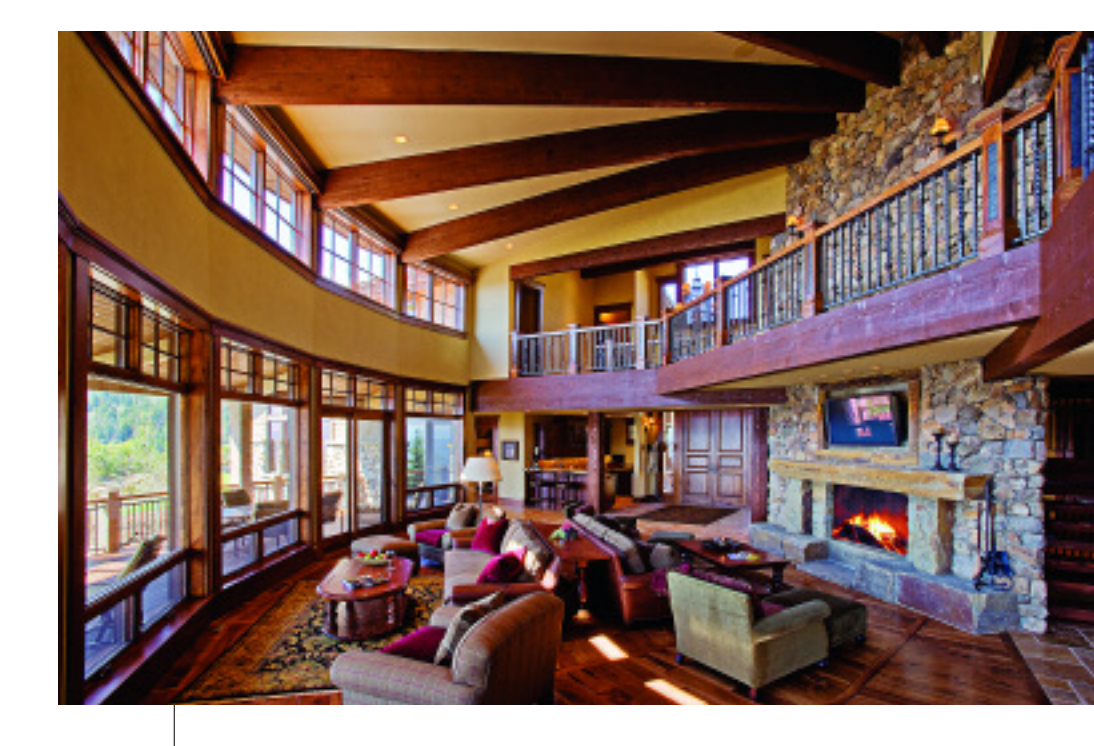
A PRISTINE LIVING AREA IS DEFINED BY CUSTOM IRONWORK AND DISTRESSED WALNUT FLOORS.

Rows of glass and a curved, covered deck ignite allure in the backyard while providing unobstructed, scenic views.