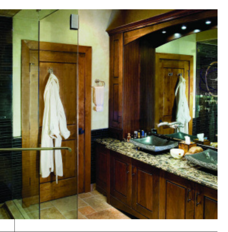
POLISHED SINKS ACT AS POSH ACCENTS AGAINST THE NEUTRAL TONES OF WOOD AND GRANITE.